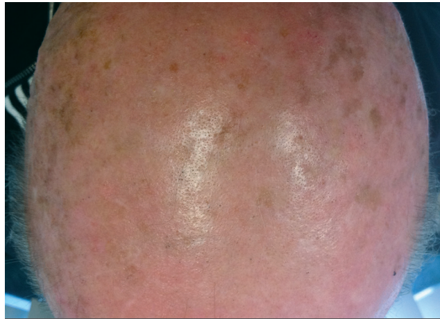
Day 7 after starting ALHYDRAN